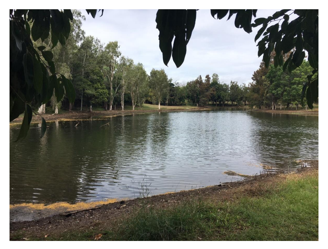
Bottom Lake After