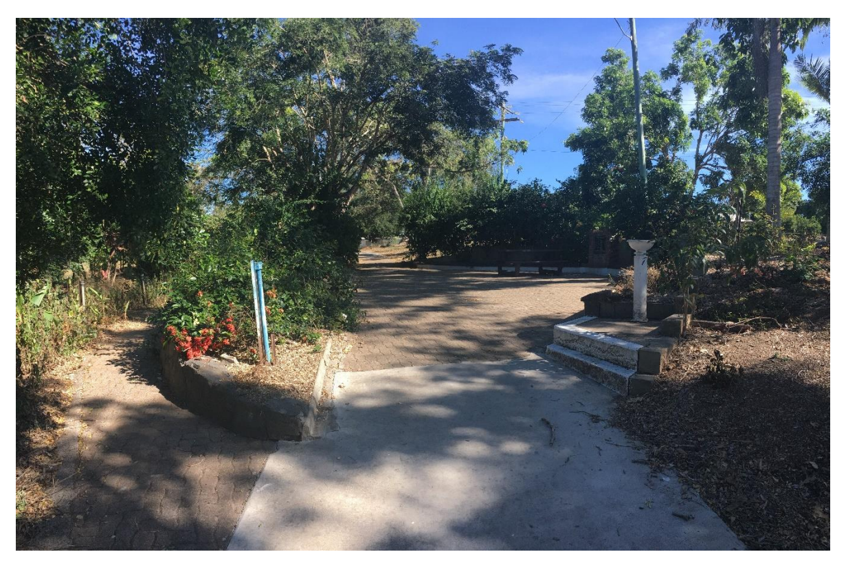
Existing Scented Garden - commemorative of Emerald Hill Crash but attracts undesirable behaviour