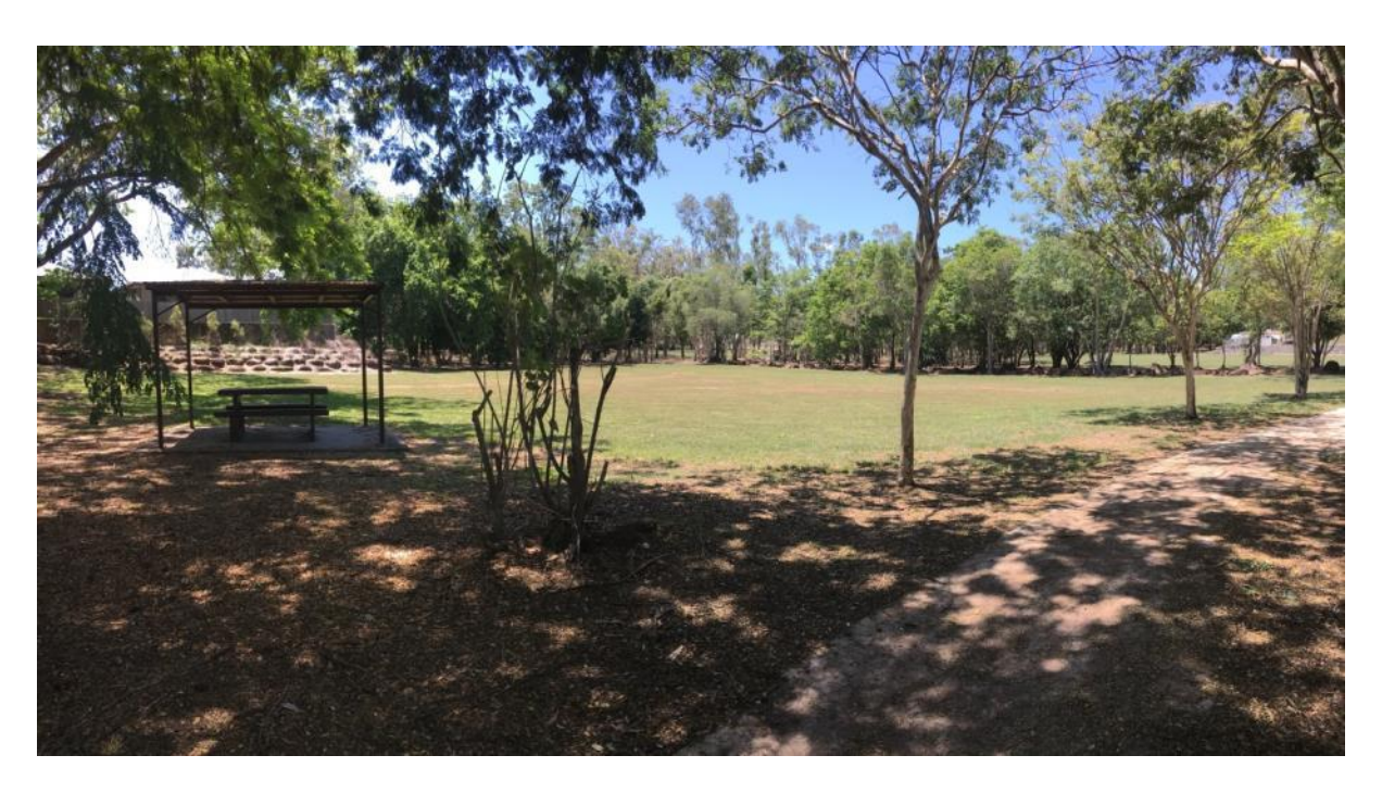
View towards proposed BBQ and adventure playground area