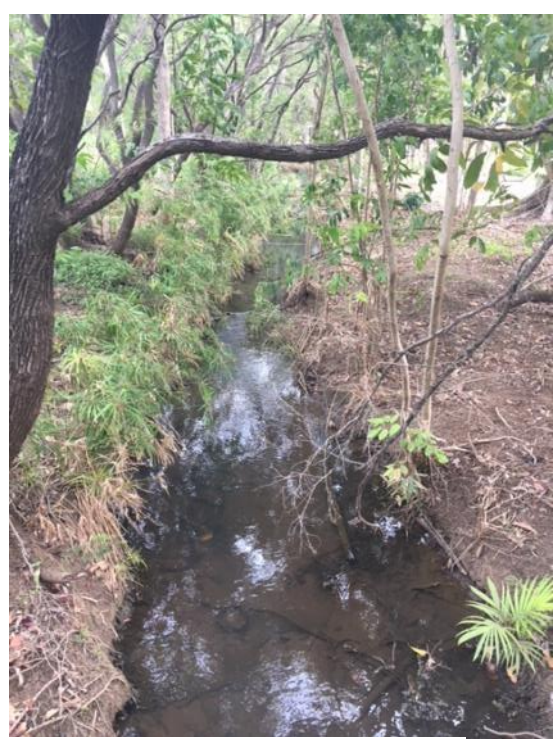
The weir removal has resulted in a lower detention time and water is flowing clear downstream. Upstream (photo RHS) water is flowing clear in a smaller channel.