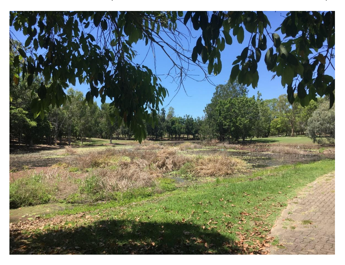
Bottom Lake Before

This has been further confirmed by the before 2018 wet season and after 2018 wet season photos: