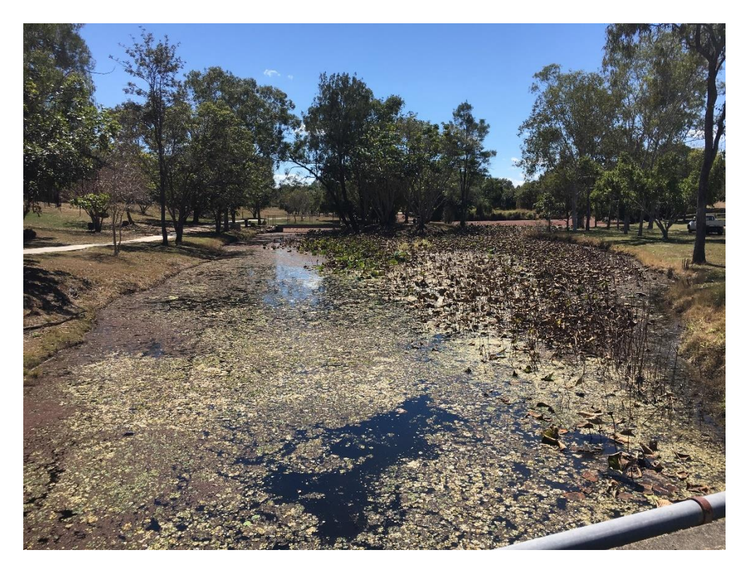
Keeble Street Before