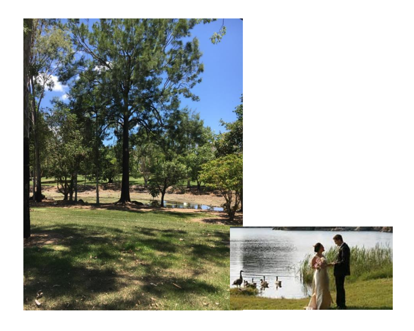
Potential wedding niche