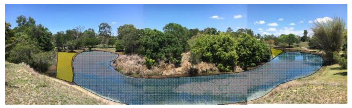
View from Lookout Hill