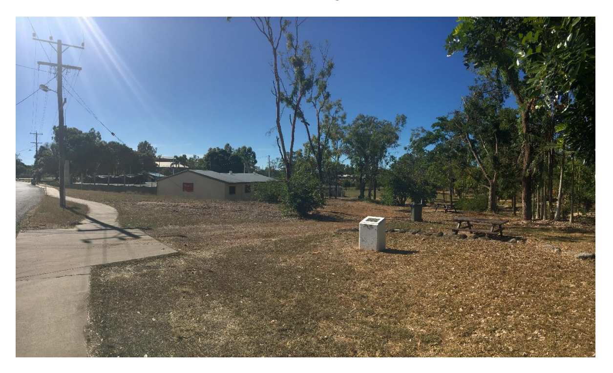
Mareeba Pool Precinct

Abbott Street - includes Mareeba Pool area and existing Perfume Garden.