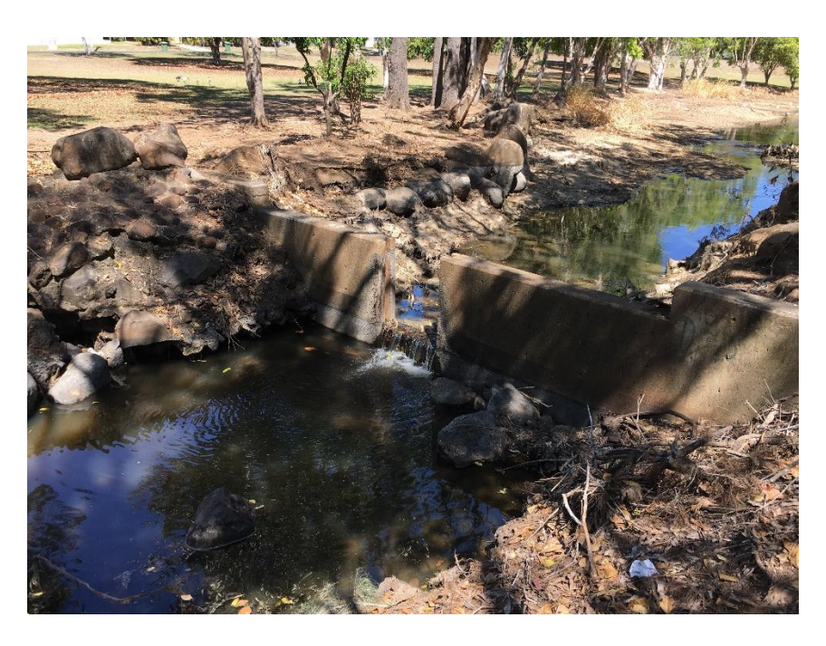
Weir with slats removed