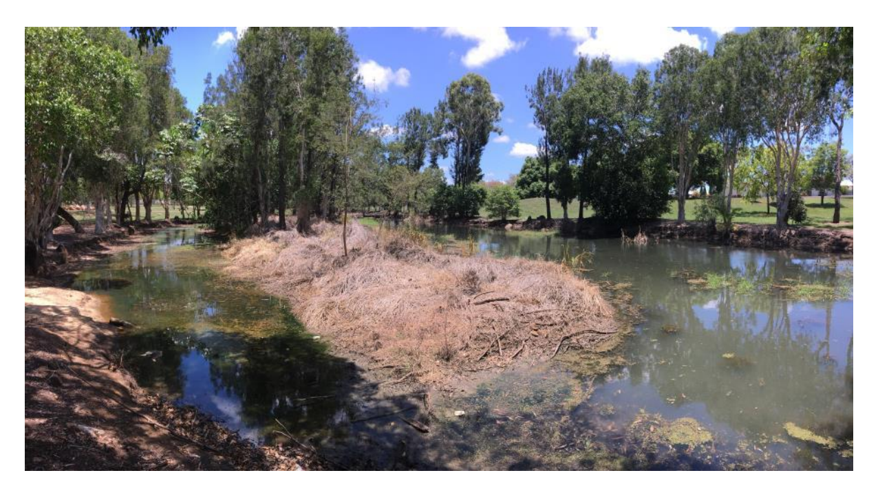
Channel to the left requires filling (high flow channel). Island requires expansion and some landscaping but would make an excellent natural play area.