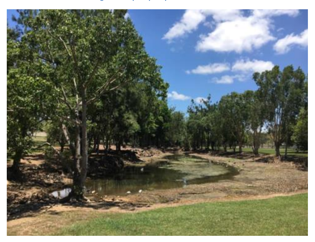
Mason Street Lake with weir out