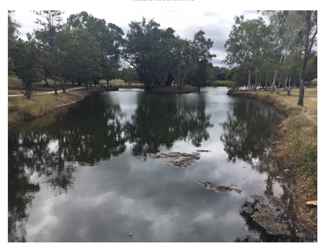
Keeble Street After