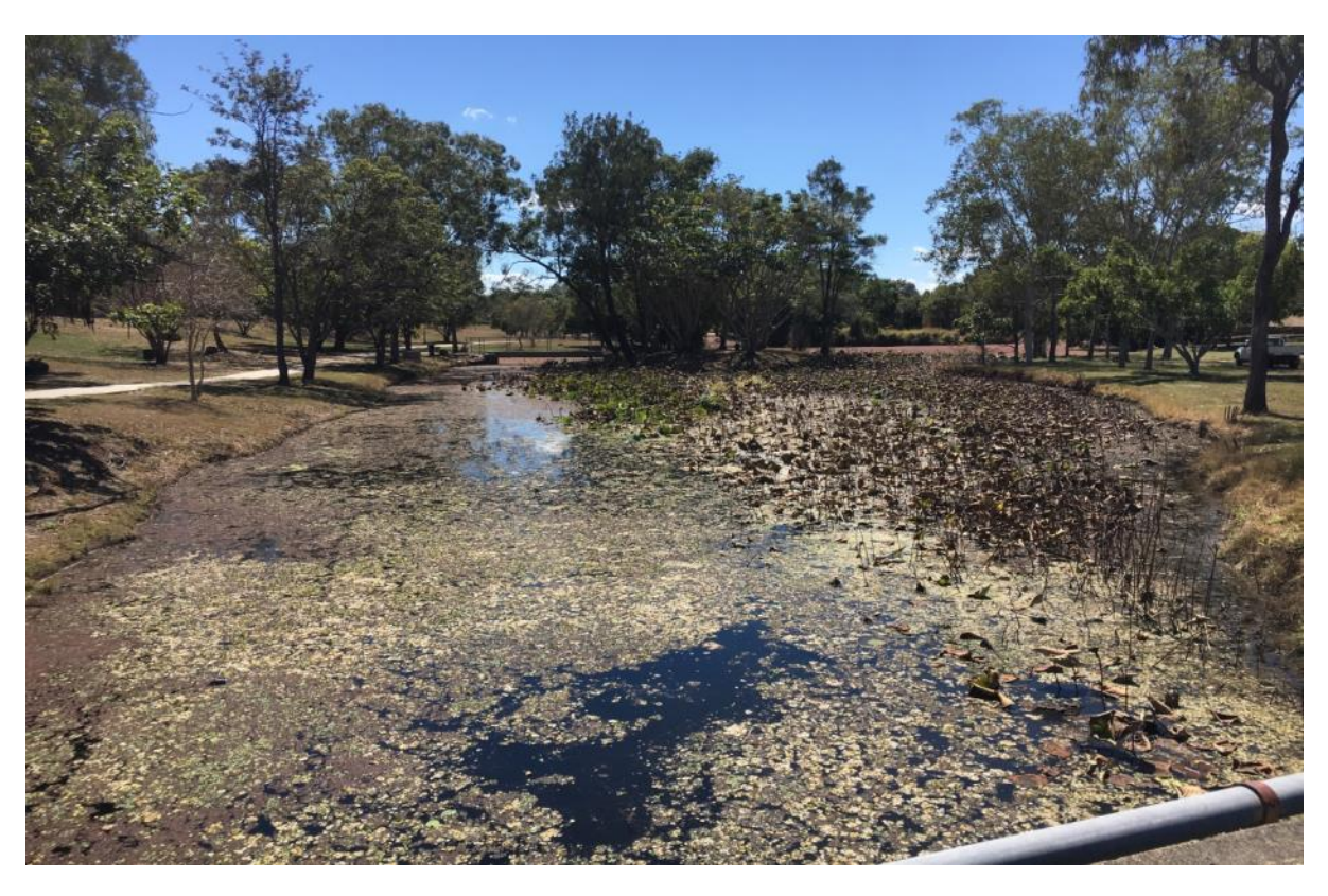
View from Keeble Street