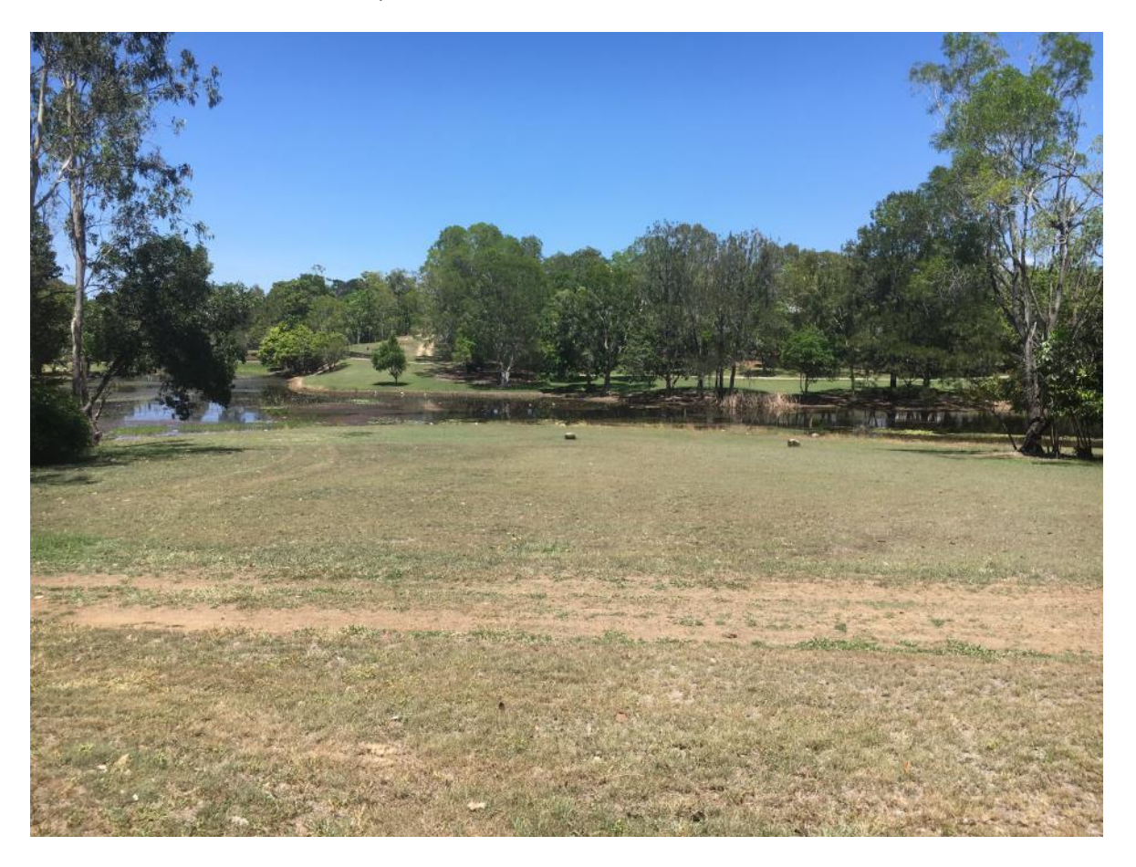
Potential Amphitheatre Area

Location : Between 1<sup>st</sup> causeway downstream from Keeble Street and Granite Creek