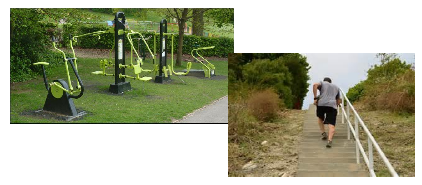
Exercise Stations & Stair next to Boxing Hall

Some edge plantings like lomandra species required for high flow sections.