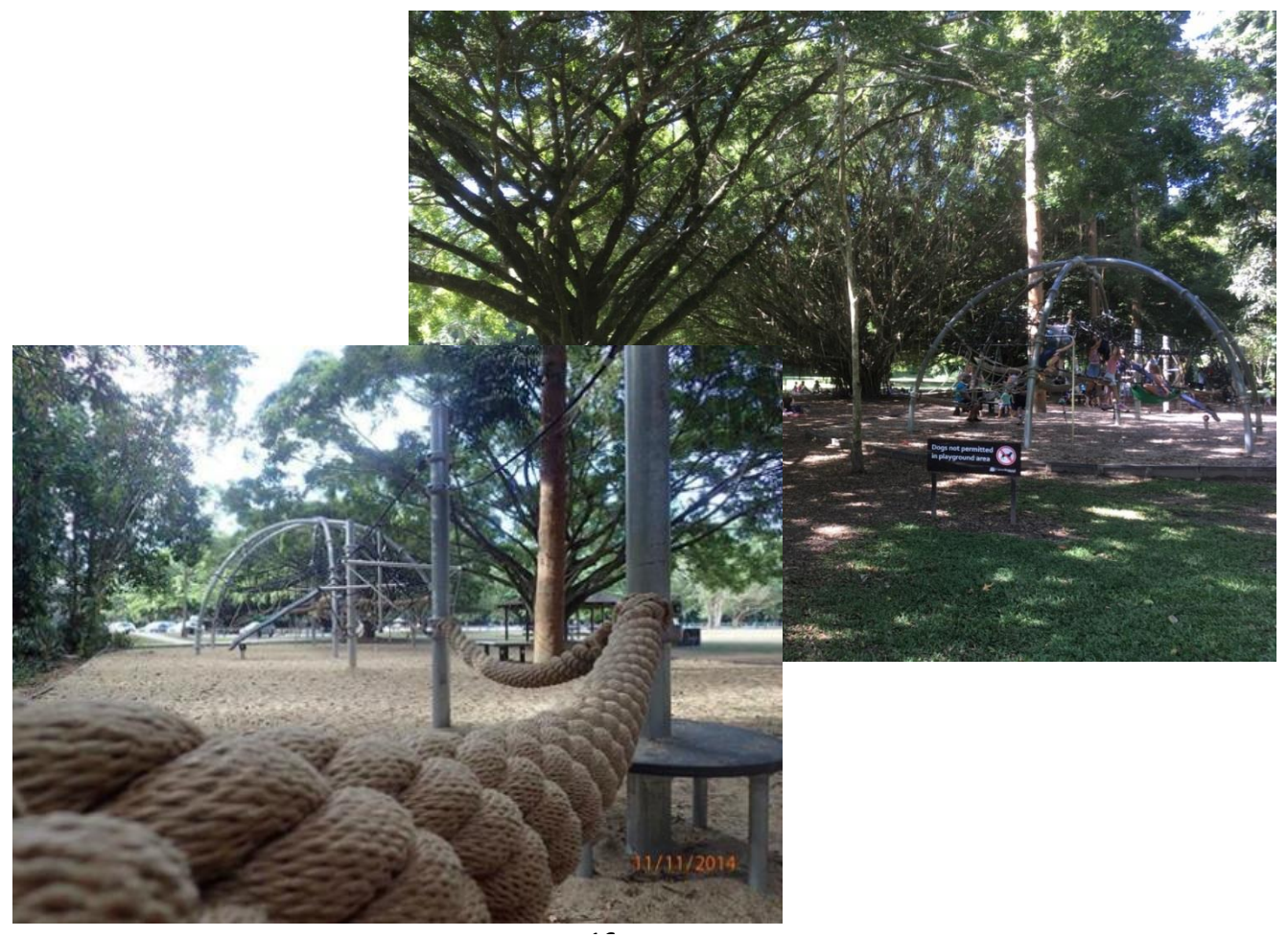
Gamburra Park Cairns - adventure rope park