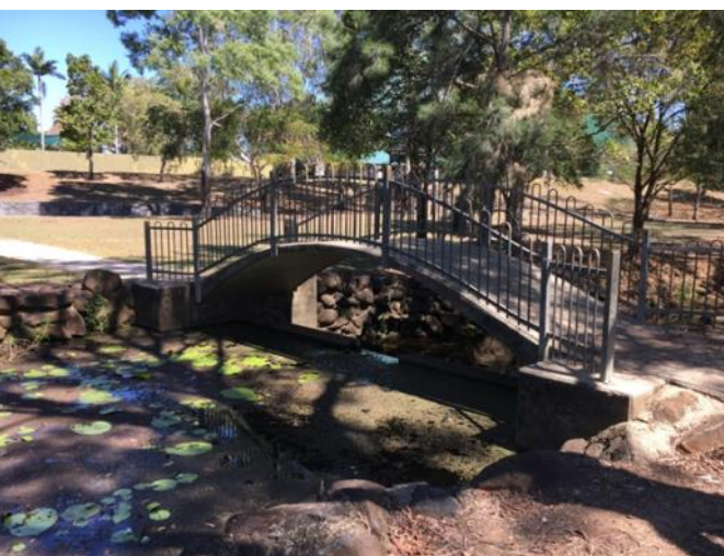
The Japanese Footbridge