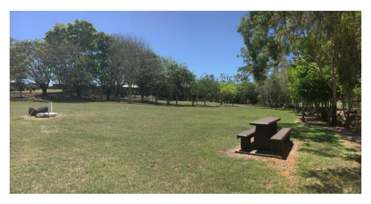
View from Keeble Street carpark