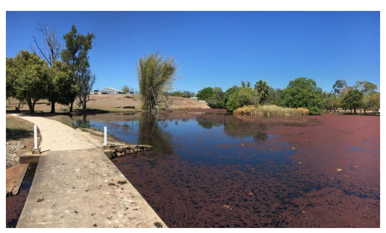
View from Foot Causeway to Keeble St