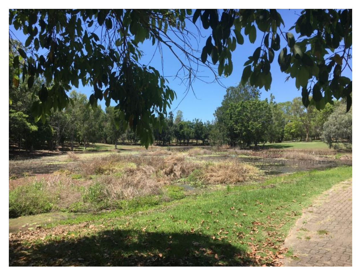
This section of the waterway needs significant reconfiguration or lowering of causeway bed.

Potential Uses: walking, running, amphitheatre.