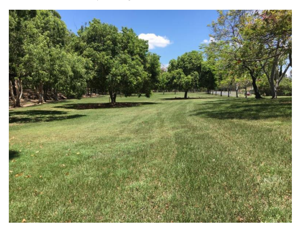
Large linear open space perfect for markets

Between Hort Street foot causeway and Ferguson Street