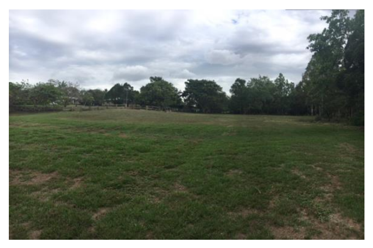
Proposed fenced dog park location

Tall trees are to replaced overtime with short tree species or large isolated shrubs. No