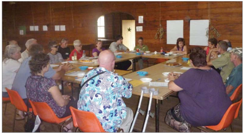
Irvinebank/Watsonville community planning workshop 14th October 2010

Irvinebank/Watsonville District Population: 370 ABS 2006 Census Usual Residents