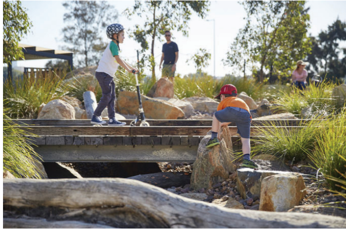
Natural creek treatment