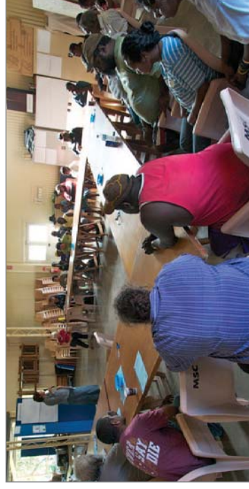
Nearly all of Chillagoe's Aboriginal adult residents attended the Indigenous Planning Workshop on 31st May 2011

Chillagoe district population: 377 Chillagoe Indigenous Population: 75 (20% of total population) ABS 2006 Census Usual Residents