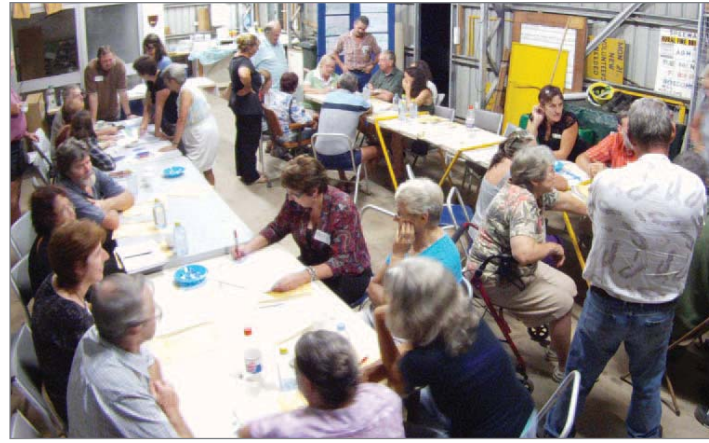
Speewah Community Planning Workshop, 2011

We are well connected to the wider world with good phone, internet and TV services and are able to travel into and out of Speewah in all weather, on safe roads. But we still give each other a wave as we cross the little wooden bridge that signifies we are home in Speewah!