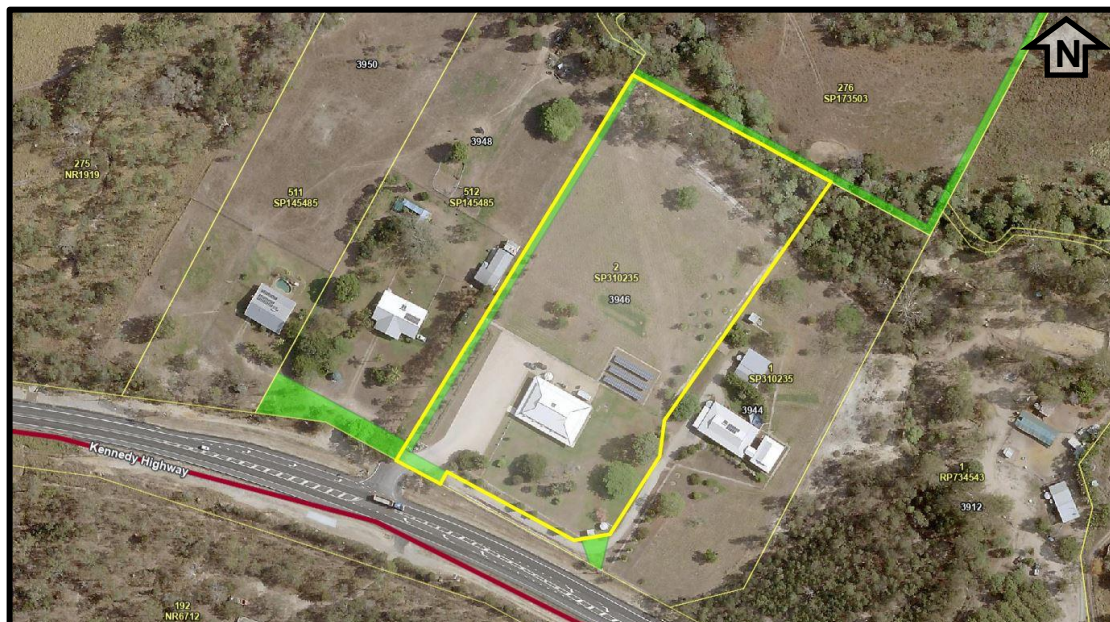
Figure 1: Development site – Lot 2 on SP310235 (Qld. Globe).

The proposed Club use will conduct business separately to the existing Food and Drink Outlet, operating partially outside the hours of operation of the Ice Creamery. The Club will be used to host gaming events both independently for the community and in cooperation with established community groups.