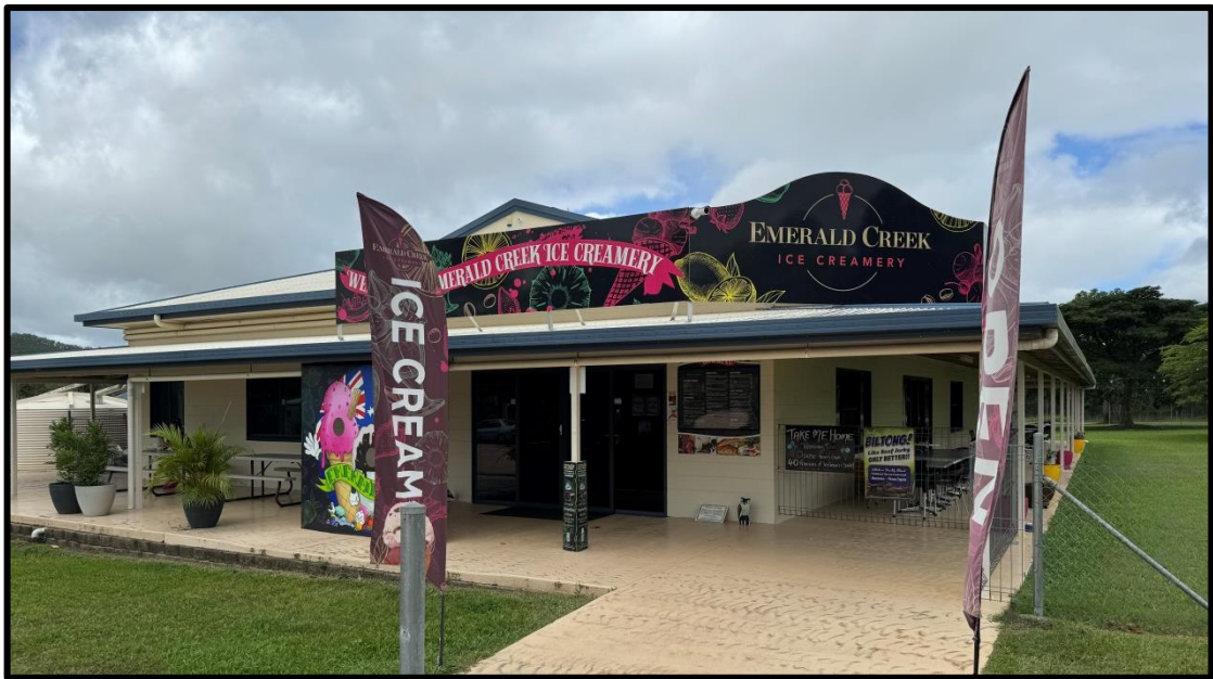
Figure 4: Existing facilities – external (Land Owner).