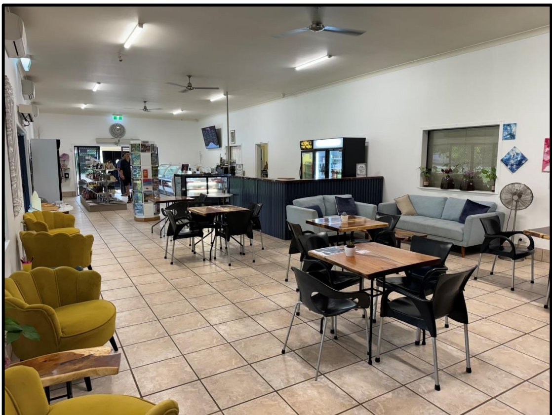
Figure 5: Existing facilities - internal (Land Owner).