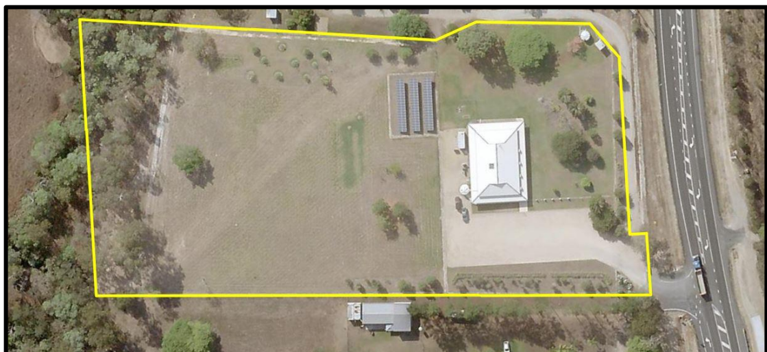
Figure 3: Development site improvements.