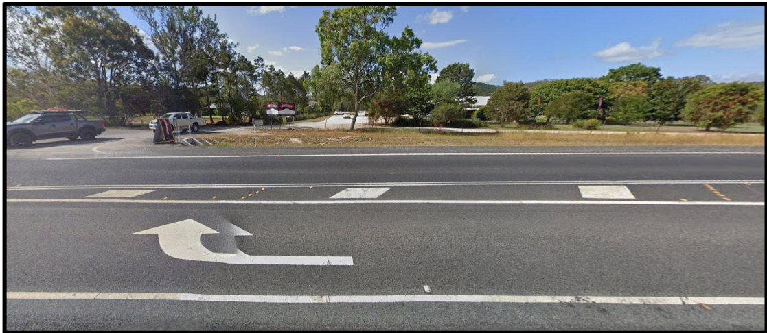
Figure 2: Development site Kennedy Highway frontage.

The site is improved with the Food and Drink Outlet building serviced by an array of photovoltaic electricity panels, an all-weather crushed stone car parking area and a sealed crossover directly accessing the Highway.