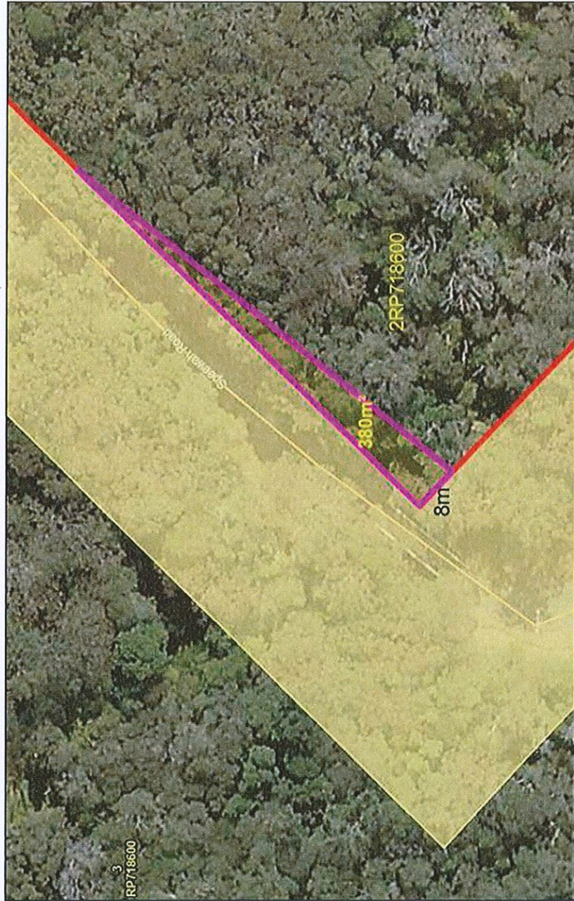
Proposed portion of land for Road Reserve dedication. (Qld. Globe) Dimensions on Boundary: 8m x 95m Total Dedication Area: 380m 2

23013 ROL – 397 Speewah Road, Speewah Qld. 4881