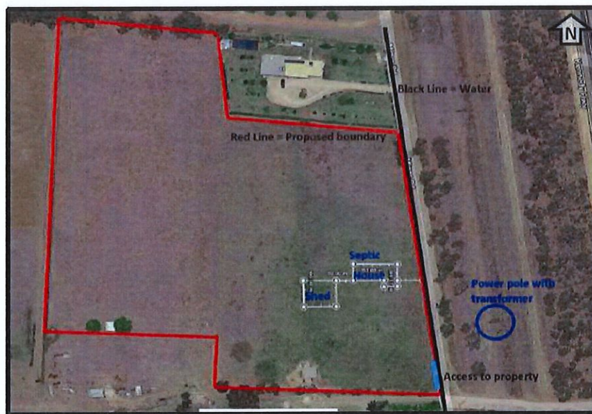
Figure 2: Proposed location of new Crossover, Dwelling and Shed.