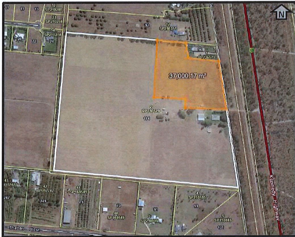
Figure 1: Proposed 1 into 2 Reconfiguration of Lot 2 on RP 376579.