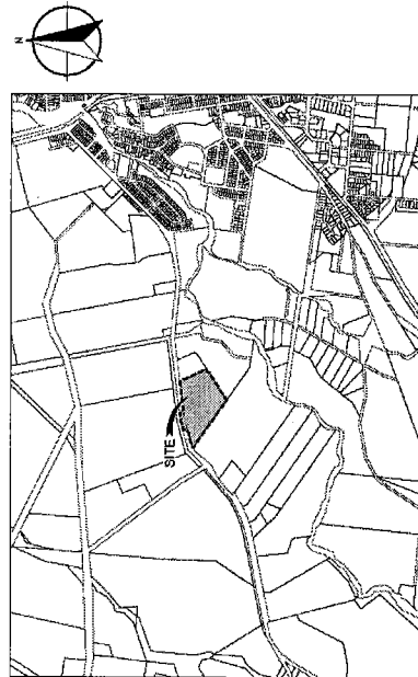
LOCALITY PLAN 1:500 SCALE